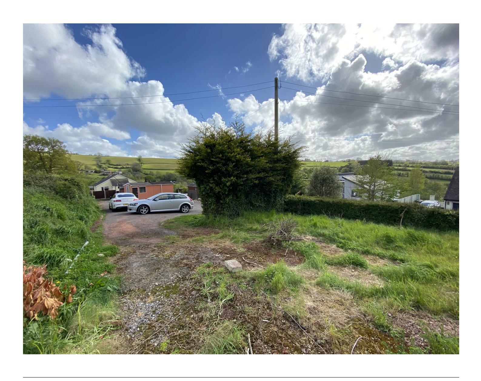
Plot at Salty Pines