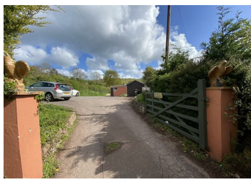
Exeter 15 miles Teignmouth 1.5 miles Torquay 8 miles

An exceptional plot in an elevated position in the desirable village of Shaldon with outline planning granted.